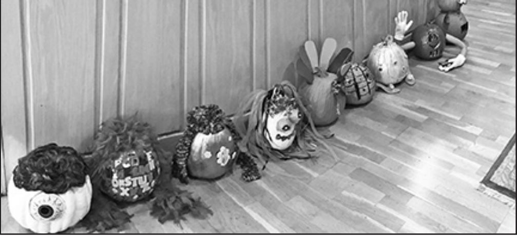
Entries included (L-R) a Cyclops, a "Smart" pumpkin, Frozen (2nd prize winner), Queenie (1st prize winner), Mr. Turkey, Spider's Web, Princess, Red M&M and Owl

Local realtors hold Pumpkin Decorating contest